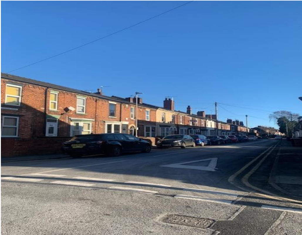
Baggholme Road - Before